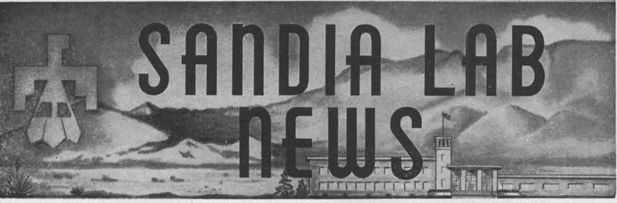
published every other friday for the employees of sandia corporation, contractor to the atomic energy commission